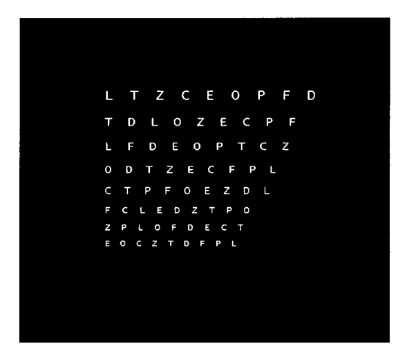
Figure 1. Eye chart stimulus

Stimuli: Figure 1 illustrates the eye chart used in the experiment. The eye chart consisted of eight rows of letters (Lucida Console font) with each row containing nine unique letters that are commonly used in the Snellen eye chart. Physical x and y pixel dimensions of each character box from lowest to highest rows were 8 by 10, 9 by 11, 10 by 12, 11 by 15, 12 by 16, 14 by 18, 15 by 19, and 16 by 22, respectively. Text color was red, green, yellow, white or black.