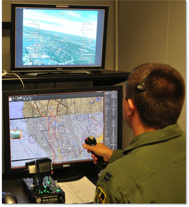
Figure 3. Simulation 3 GCS set up with the Manual HOTAS control mode.

Overall the results of the Rorie & Fern study directly demonstrate the substantial effect that control mode interfaces can have on pilots' ability to comply immediately to ATC commands. Further, these results can be extrapolated to likely response times for pilots using various control mode interfaces to respond to self-separation and collision avoidance alerting, a critical component of any future Detect and Avoid (DAA) system for UAS.