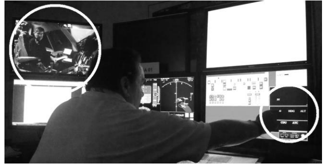
Figure 2. Ground station in SPO with the Collaboration Tools configuration, with video feed on the left and CRM indicators on the right.

A large quantity of data was gathered on each flight, including aircraft state information (recorded at ten hertz), video recordings, and audio recordings. This paper will focus on subjective data from two questionnaires. After each scenario, pilots completed a brief (11-question) posttrial questionnaire. This focused on pilots' perceptions and cognitive processes related to that specific flight, such as workload and decision-making. After all flights, the pilots completed an extensive post-simulation questionnaire in which they were asked to give additional feedback. This