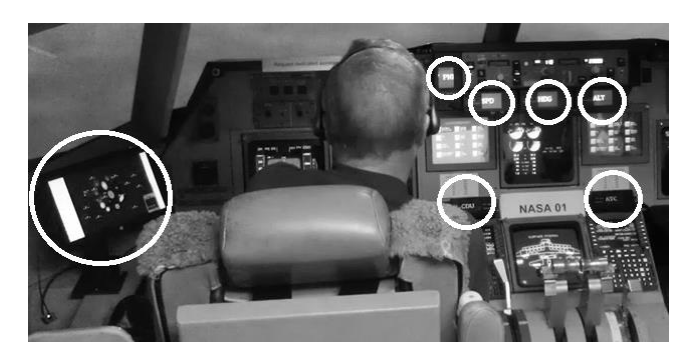
Figure 1. Flight deck in SPO with Collaboration Tools configuration, with EFB tablet displaying shared plan view on the left and CRM indicators on the right. The video feed is on an EFB out of view on the far right of the cockpit.

In Baseline, the participant assigned the role of the Captain occupied the left seat of the ACFS. For CT and NCT configurations, the Captain remained on the flight deck as single pilot and the FO moved to the ground station to