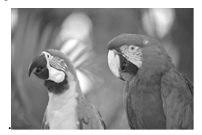
Figure 1. Grayscale version of color image used to design the matrices shown in Fig. 2.

Figure 1 shows a grayscale miniature of an image for which we designed an optimized matrix. The image was acquired from a Kodak PhotoCD demonstration disc at a resolution of 512x796 pixels. It was converted to RGB (24 bits/pixel) in Abobe Photoshop