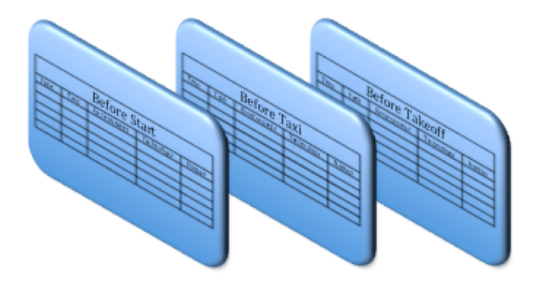
Figure 3. Aviation Task Analysis Tool by phase of flight.

When multiple phases must be considered, the structure will become cumbersome unless different phases are described on separate sheets (see Figure 3).