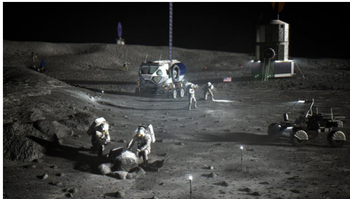
Figure 2: Artemis Lunar Surface Operations concept art

Certain Lunar mission architectures may experience 5-7 second one-way communication delays, and like Mars missions, will face limitations to onboard mass and resupply. Lunar missions will also be challenged by reduced opportunities to evacuate back to Earth in the event of an emergency. Planetary surface operations also introduce additional mission complexity and environmental factors that impact maintenance, including dust, partial gravity, and extreme fluctuations in lighting [5].