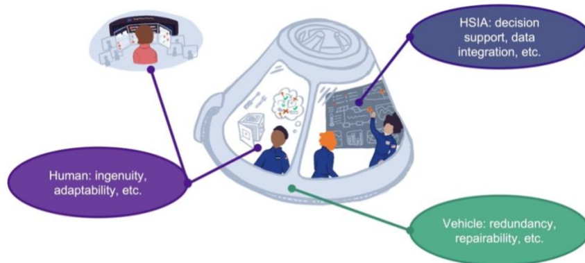
Figure 3: Concepts for human-systems resilience beyond low-earth orbit

HCI practitioners can contribute to mitigating this risk by continuing to develop supportive technologies that enhance the capabilities of the onboard human-system team to perform maintenance. Research areas including interaction with complex engineering data sets and immersive training tools are of special interest to the HCI community.